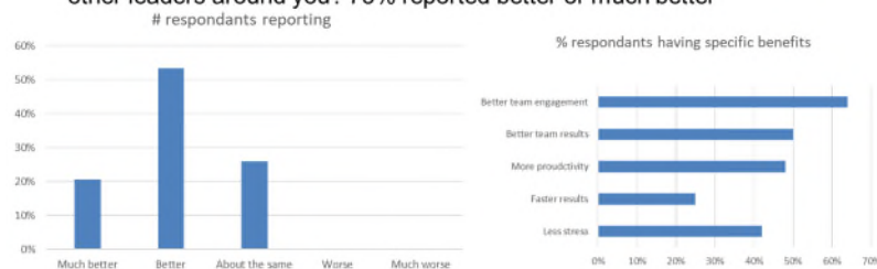
How much better have you coped in Covid-19 uncertainties compared to other leaders around you? 75% reported better or much better

Leaders who enabled, as far as possible, self-organisation based on a new way of looking at leadership did better. But in that there is a problem. Among the various systems which vary in different organizations, there are three main and common ones adopted by HR as traditional “tools”. These have been popular for many years, especially in large and established, complex companies: